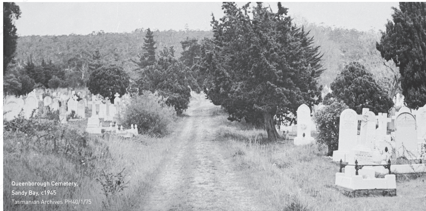
Queenborough Cemetery, Sandy Bay, c1945 Tasmanian Archives PH40/1/75

Student guides from The Hutchins School will be placed along the road to assist with directions.