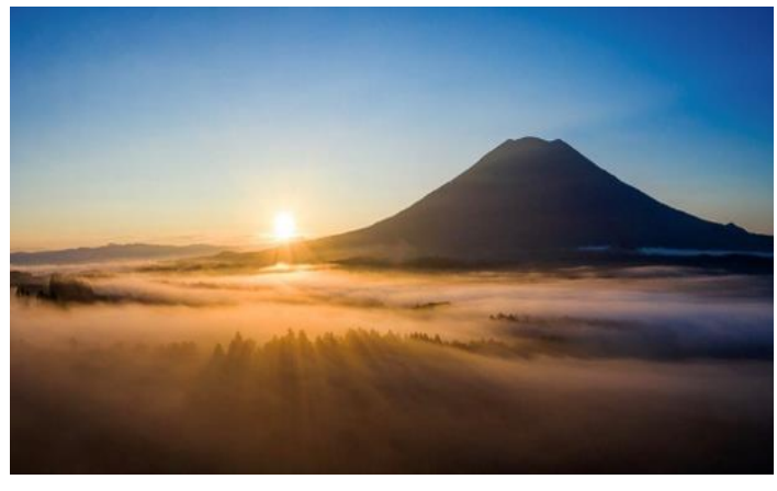
Sunrise in Niseko - one of Stuart's families favourite places to visit and relax.