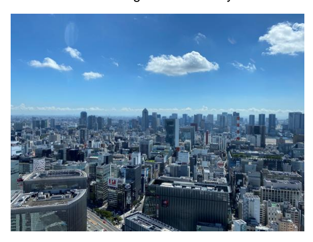
The view from his office window, looking out over the Ginza shopping district and Marunouchi in Tokyo.

Below are some images Stuart kindly shared with us.