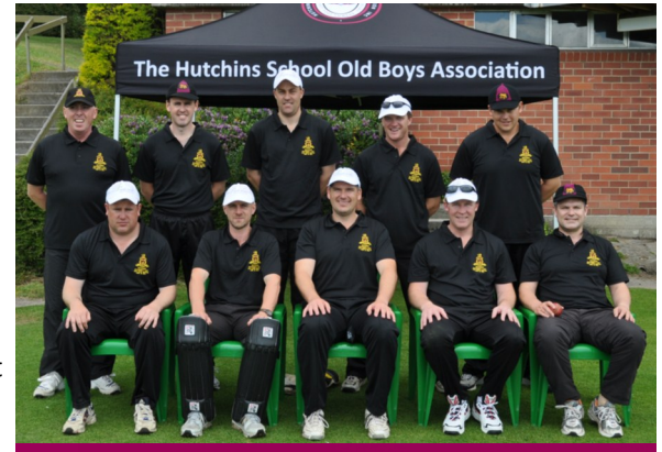
Hutchins Old Boys XI

It was a tremendous victory to the Hutchins Old Boys; a most joyous occasion where the banter was strong and competitive, yet the gratitude for the opportunity was overwhelming.