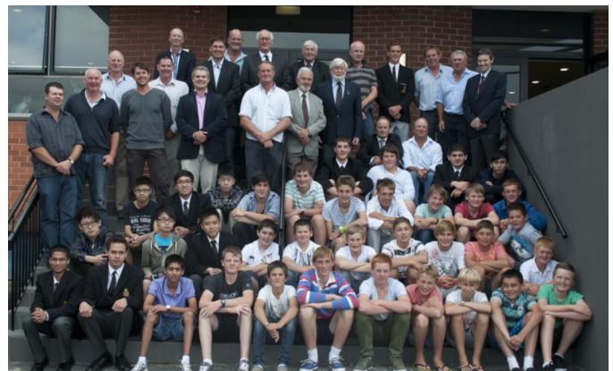
Past and current Hutchins Boarders