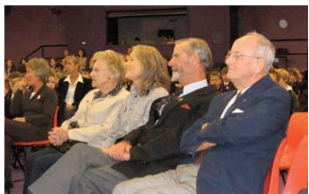
Guests of Honour at the Junior School 50th Anniversary Assembly