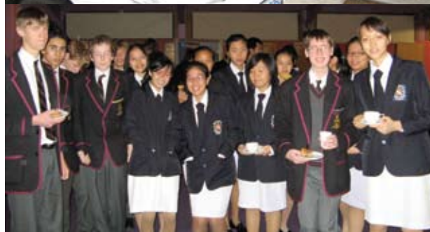
A group of students enjoying morning tea on the final day.