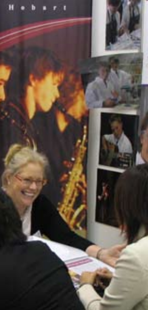
Piaget students hiking during visit to Hutchins

Education expos to promote Hutchins and offer education opportunities for students from