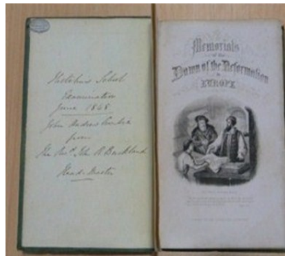
Memorials of the Dawn of the Reformation in Europe (1847)