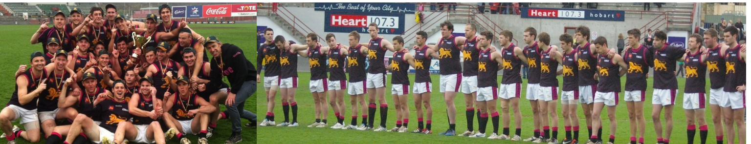
From Left: Old Boys Seniors 2012 Premiership winners and before the big game lining up for the pre-game anthem. Well done boys!!